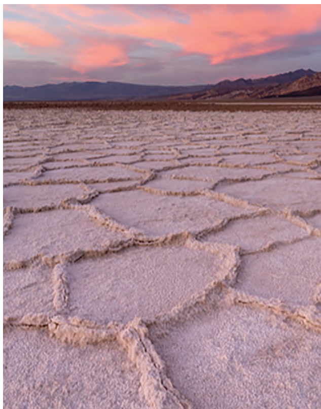
FIGURE 1. SALT POLYGONS at Middle Basin in California's Death Valley.

Theories based on the mechanics of the crust are logical candidates for several reasons. Dry salt is hard and brittle. The ridges bordering the polygons are often broken up by cracks, as in figure 1. Some salts, like sodium sulfate, change state near room temperature, absorbing or releasing moisture while dramatically altering their size. Their swelling can generate enough